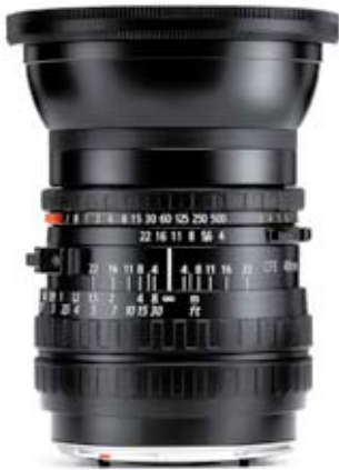
CFE 4/40 mm

The lenses use high performance central lens shutters, making them stable, quiet, and particularly useful for flash work at fast shutter speeds or many other tricky lighting situations. And thanks to the T* anti-reflection coating and internal stray light reduction treatments, these lenses produce unbeatable image contrast and color saturation.